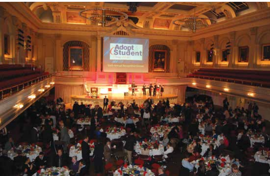
Guests pack Mechanics Hall for the annual recognition dinner.

To see more photos from the evening visit our website at Adopt-A-Student.net .