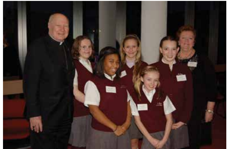
St. Peter's Central Catholic Elementary School

Received outstanding achievement in art, science, language arts and social studies