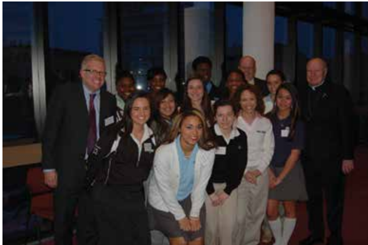
Holy Name Central Catholic Jr./Sr. High School

High Honors, Senior Class Scholarship, Marlene Kemp Farley Scholarship