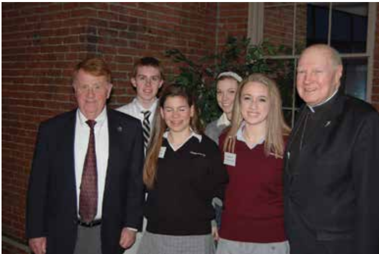
Saint Bernard's Central Catholic High School

Received Affordable Excellence Scholarship and RWU grant